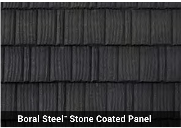
Shown in PINE-CREST Shake Charcoal

These components provide energy efficiency and give great return on your investment.